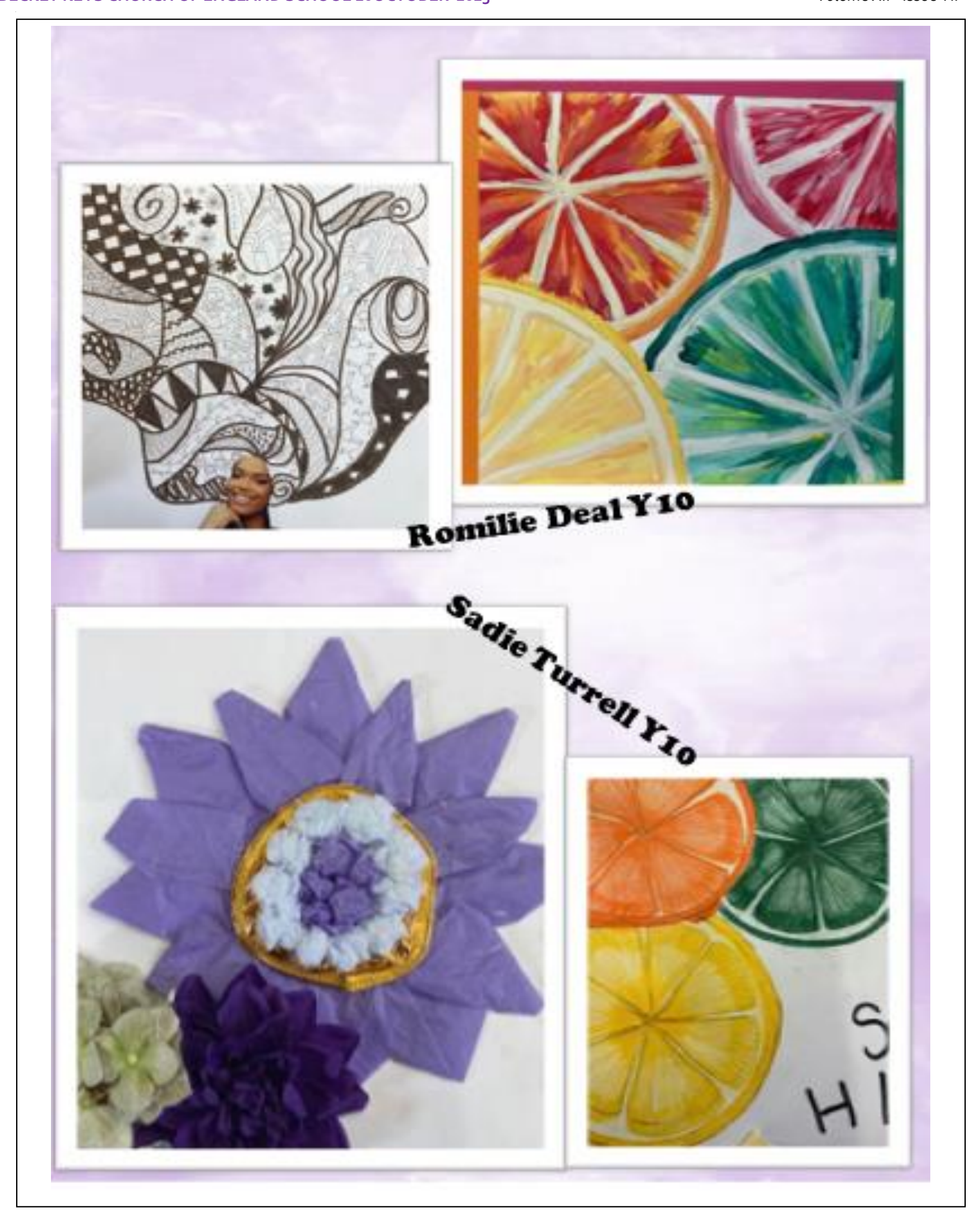
Page 11 of 12