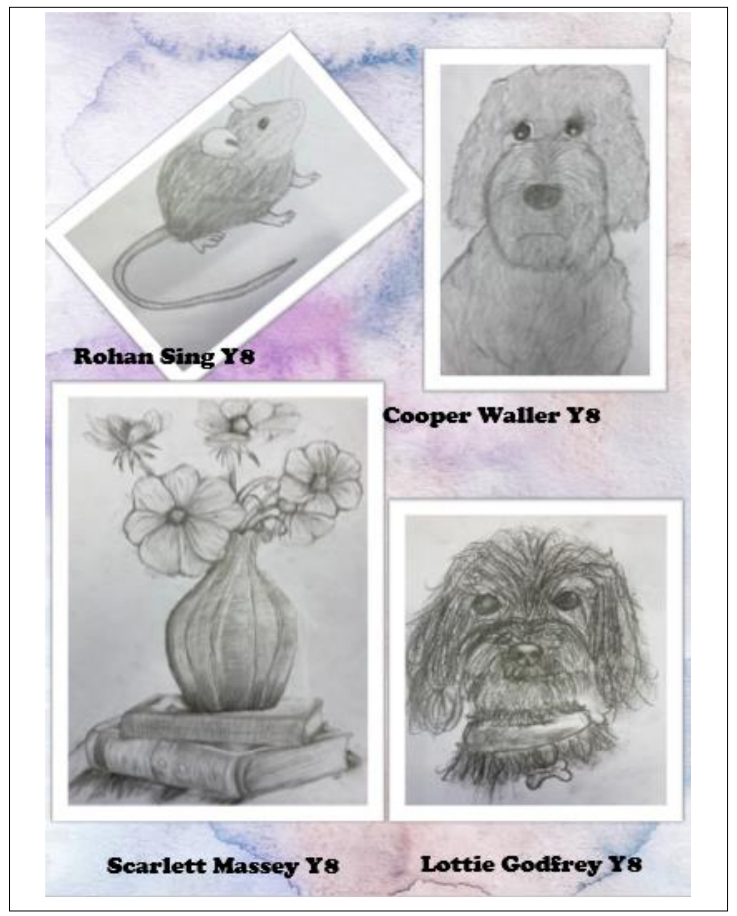
Page 9 of 12