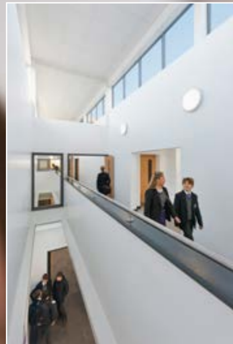
The Justin Welby Building