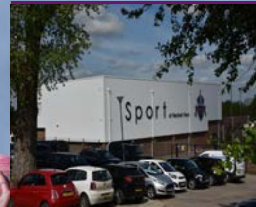
New Sports Hall